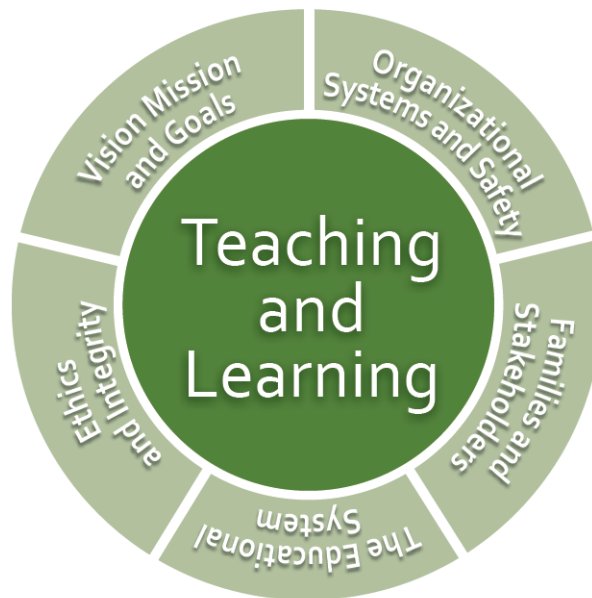
Figure 3: Leadership Practice – 6 Performance Expectations

These weightings should be consistent for all principals. For assistant principals and other school or district-based 092 certificate holders in non-teaching roles, the six performance expectations are weighed equally, reflecting the need for emerging leaders to develop the full set of skills and competencies in order to assume greater responsibilities as they move forward in their careers. While assistant principals' roles and responsibilities vary from school to school, creating a robust pipeline of effective principals depends on adequately preparing assistant principals for the principalship.