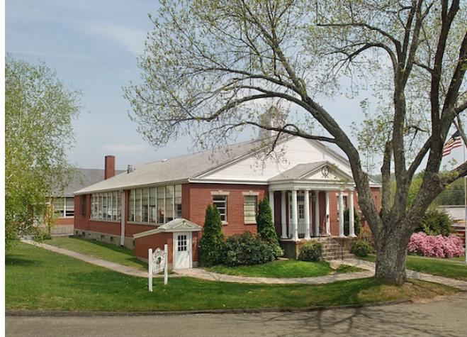
Eastford Elementary School

Revised June 2015 The following pages represent the plan issued by the State of Connecticut SEED 4/27/2015