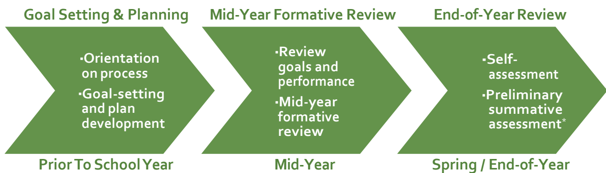
Figure 1: This is a typical timeframe:

* Summative assessment to be finalized in August.